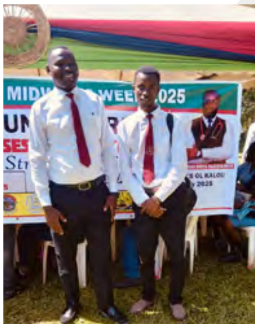
A section of Busia Campus students during the International Nurses Week held in Busia Town.

During the event, speakers highlighted the importance of compassion, care, and community service in nursing, and encouraged ongoing collaboration to strengthen healthcare in the region. The celebration left a positive impact on the children and reinforced the spirit of service and commitment that defines the nursing profession.