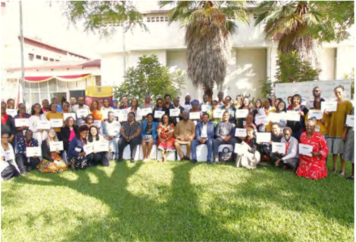
Participants display their certificates following graduation from the training.