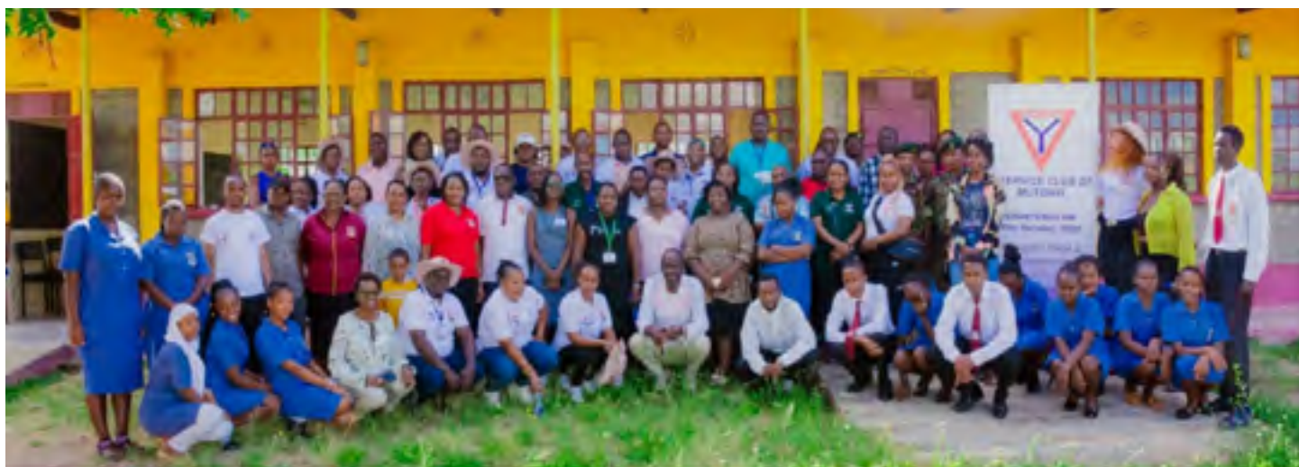
A section of KMTTC Mutomo and Kitui Campus staff, students and members of the Y Service club, during a visit to Mutomo Campus.