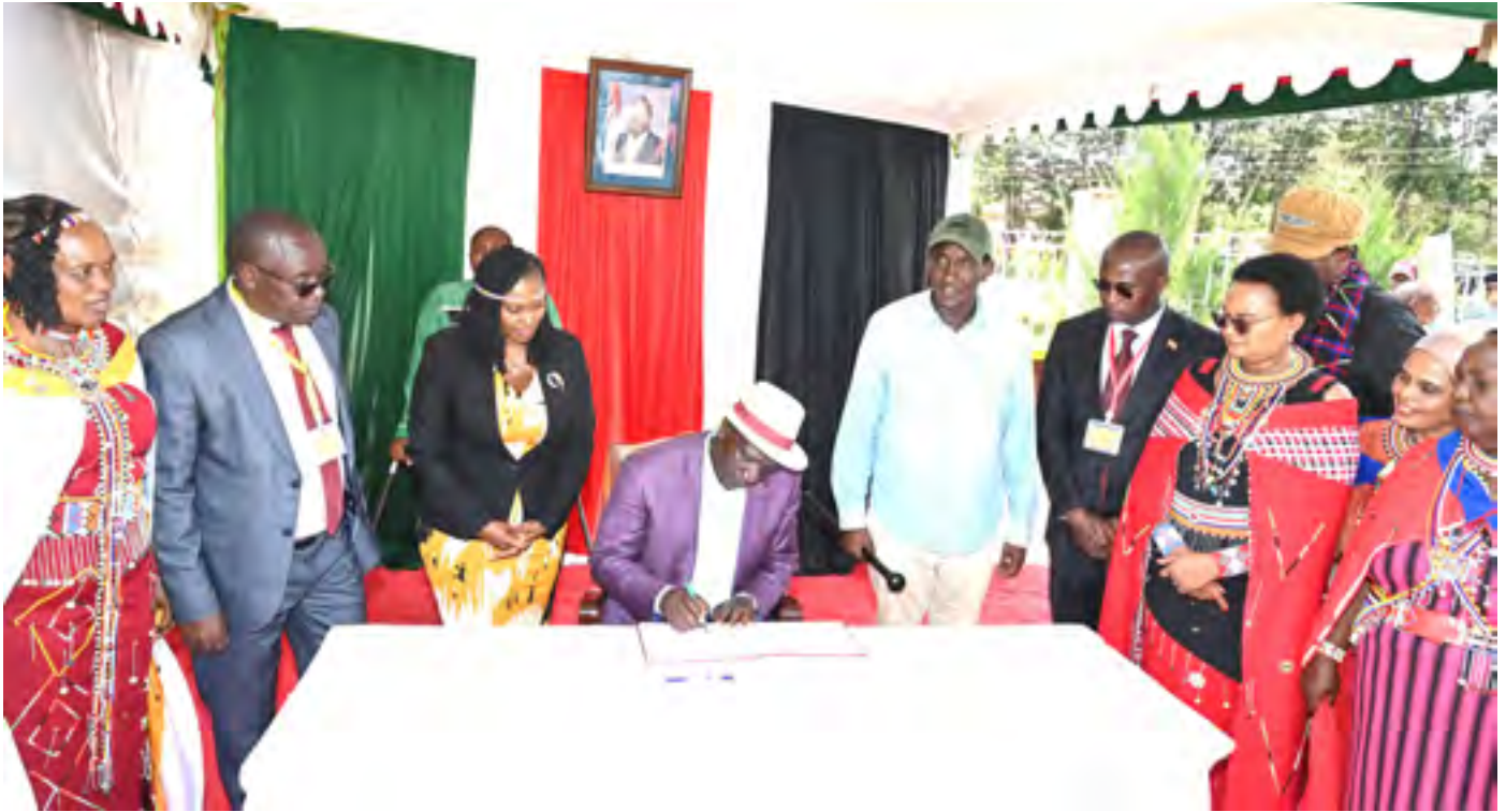
President Ruto signs the Visitor's book upon his arrival at Narok Campus.