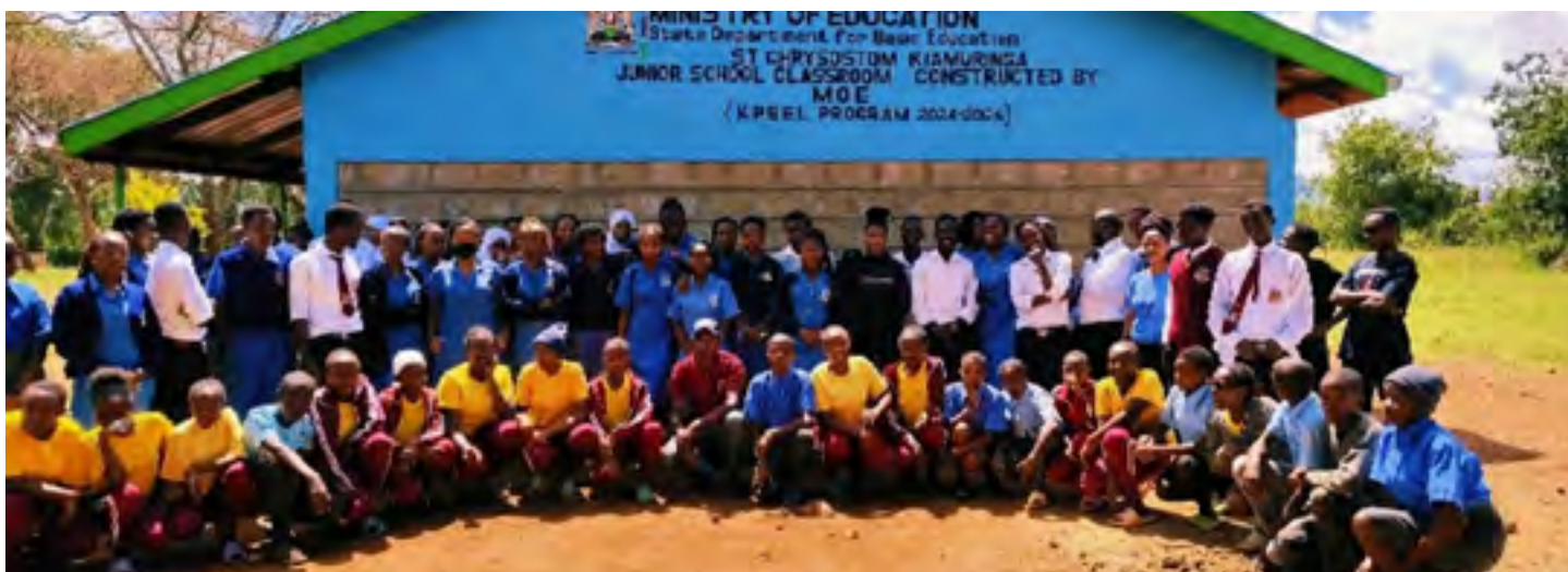
Embu Campus held a motivational talk and tree planting activity at Kiamuringa Primary School in Mbeere South, Embu County, on May 17, 2025 as part of their efforts to market the College programmes and give back to the community.