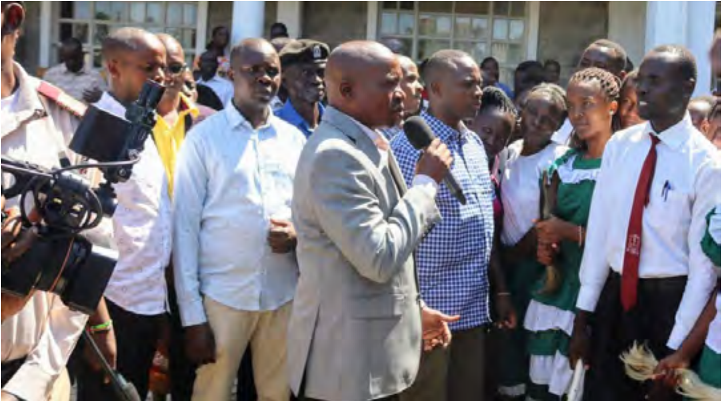
Deputy President Prof. Kithure Kindiki makes his address at Teso Campus.

D eputy President Prof. Kithure Kindiki paid a courtesy visit to KMTC Teso Campus on May 18, 2025 while on his way to an interdenominational prayer service in Amagoro Township.