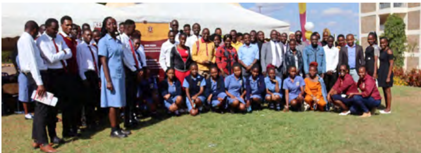
A section of Chuka staff, students and alumni during Alumni day.