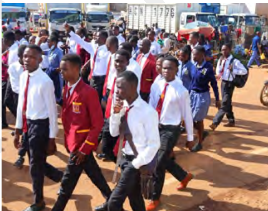
A section of Teso Campus students during the International Nurses Week in Busia Town.