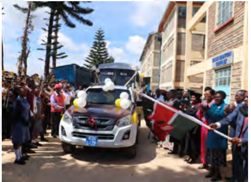
Deputy President Prof. Kithure Kindiki launched newly acquired vehicles for KMTC Kangema during the Michuki National Polytechnic graduation ceremony (held on May 9, 2025), marking a milestone that will enhance transportation and support health training in the Campus.

He encouraged students to embrace hard work, discipline, leadership, and warned against substance abuse. He emphasized that dedication and responsible choices would help them seize national opportunities and contribute meaningfully to society.