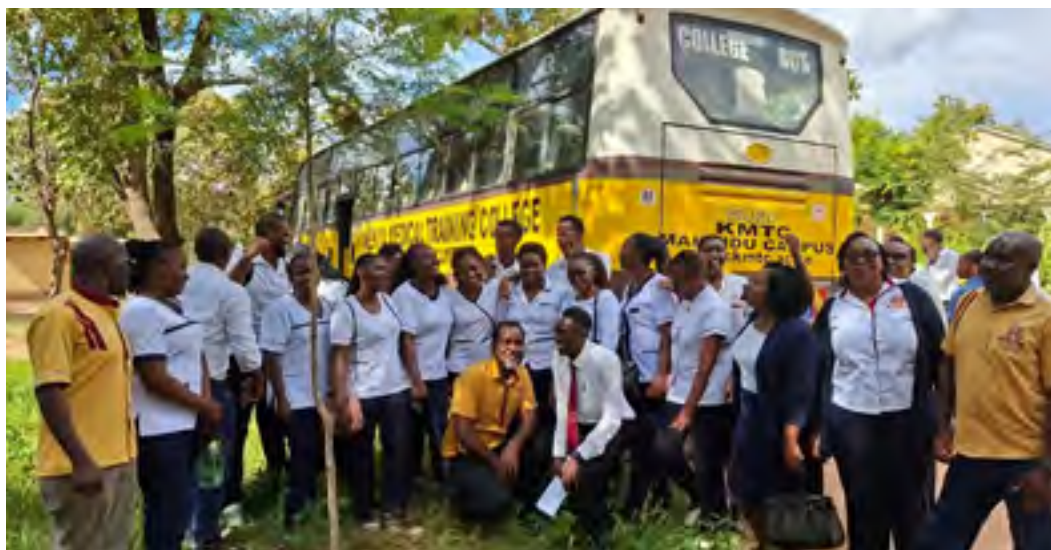
Makindu Campus during the International Nurses week celebrations at Kathonzweni, Makueni County.

Participants included nursing lecturers, students, practicing nurses from local hospitals, staff and children from the children's home. The day featured a variety of activities such as edutainment, donation of food and essential items, counseling services for the children, tree planting for environmental conservation, and a cake-cutting ceremony. The event concluded with a candle-lighting session and the recitation of the