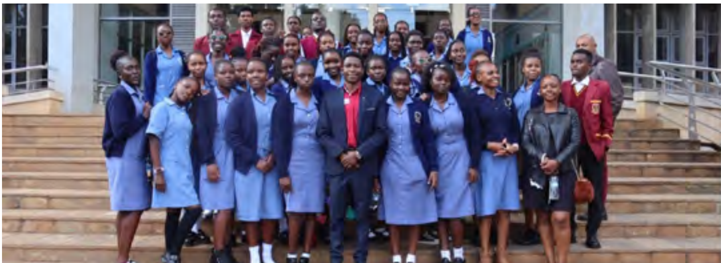
Karuri Campus Staff and Students attended the World Missing Day at Catholic University of Eastern Africa on May 16, 2025.