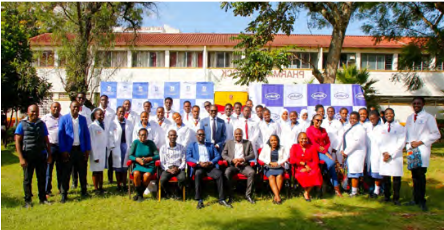
Participants during the mentorship programme.

The Kenya Pharmaceutical Association (KPA) Nairobi Branch hosted a mentorship program at the KMTc Nairobi Campus on May 27, 2025, targeting third-year (final-year) Pharmacy students.