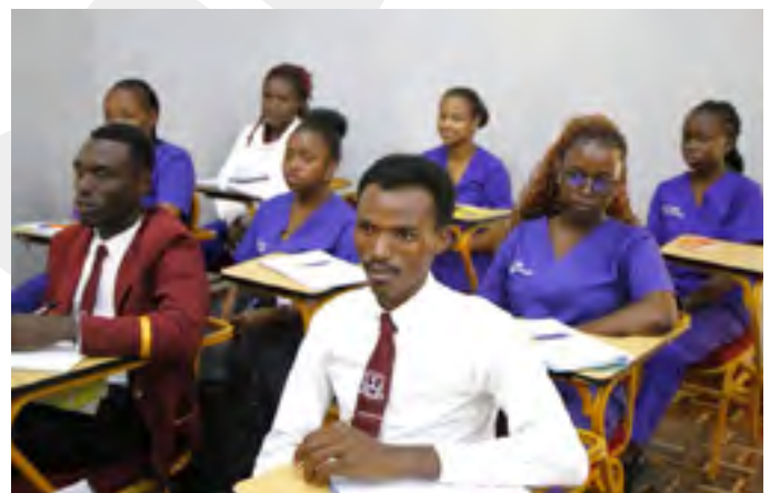
A section of students during the training.