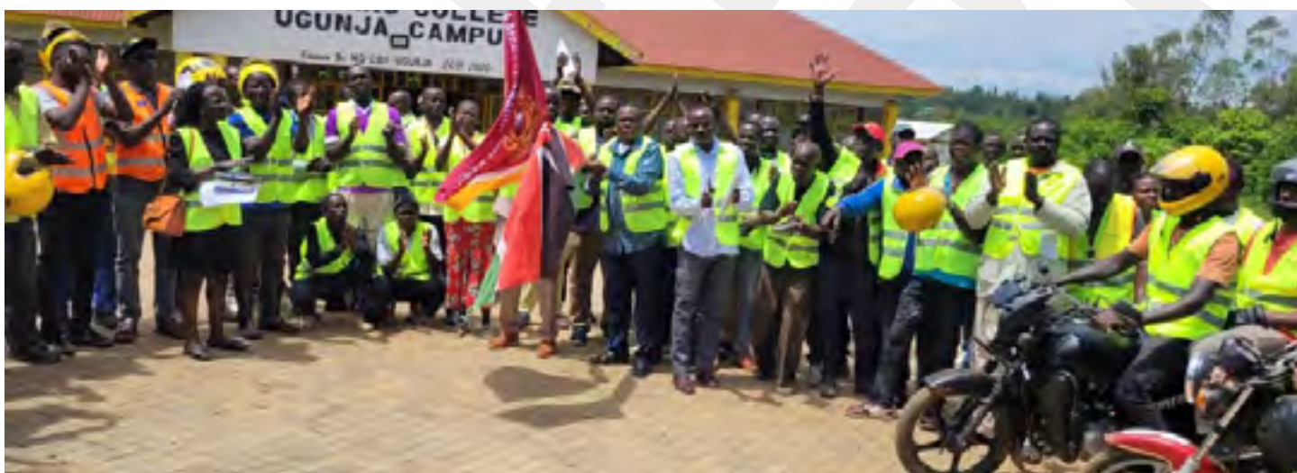
Ugunja Campus, with support from the Siaya County Government, trained 75 boda boda riders in first aid and road safety on May 10, 2025, with NTSA officials providing guidance and donating reflector jackets to strengthen emergency response and community road safety.