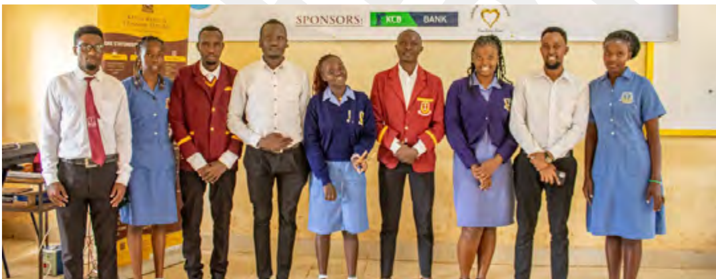
A section of Karuri Campus students during the World Menstrual Day, 2025.