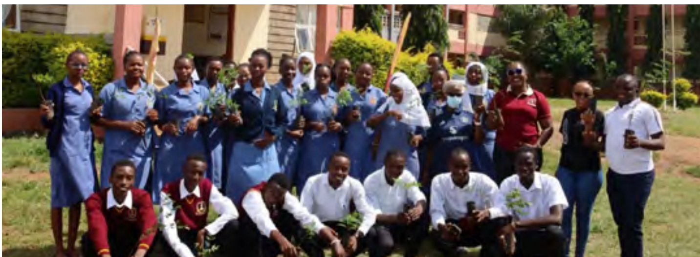
On May 23, 2025, KMTC Taveta Campus planted assorted trees to promote environmental conservation.