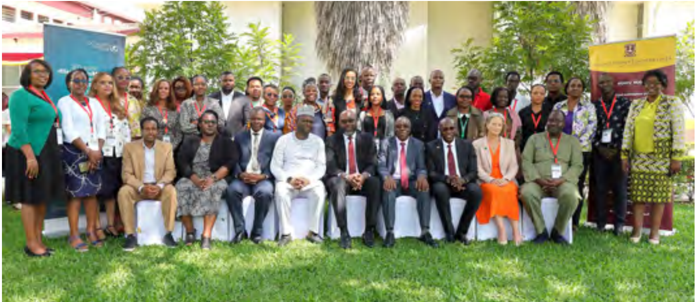
Participants during the official opening of the training.

A total of 50 mental health professionals from 11 African countries have graduated from an intensive two-week Mental Health Leadership and Advocacy training, marking a significant milestone in advancing mental health care across the continent.