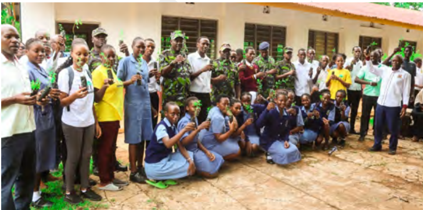
KMTC Msambweni students and staff, together with the Kenya Navy and community-based organizations, planted 1,000 tree seedlings on campus on May 20, 2025, as part of their ongoing commitment to environmental conservation.