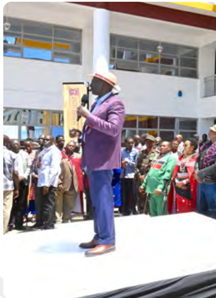
President William Ruto speaking at Narok Campus.

“Health is a right, not a privilege. Every Kenyan deserves access to the highest attainable standard of healthcare,” he emphasized.