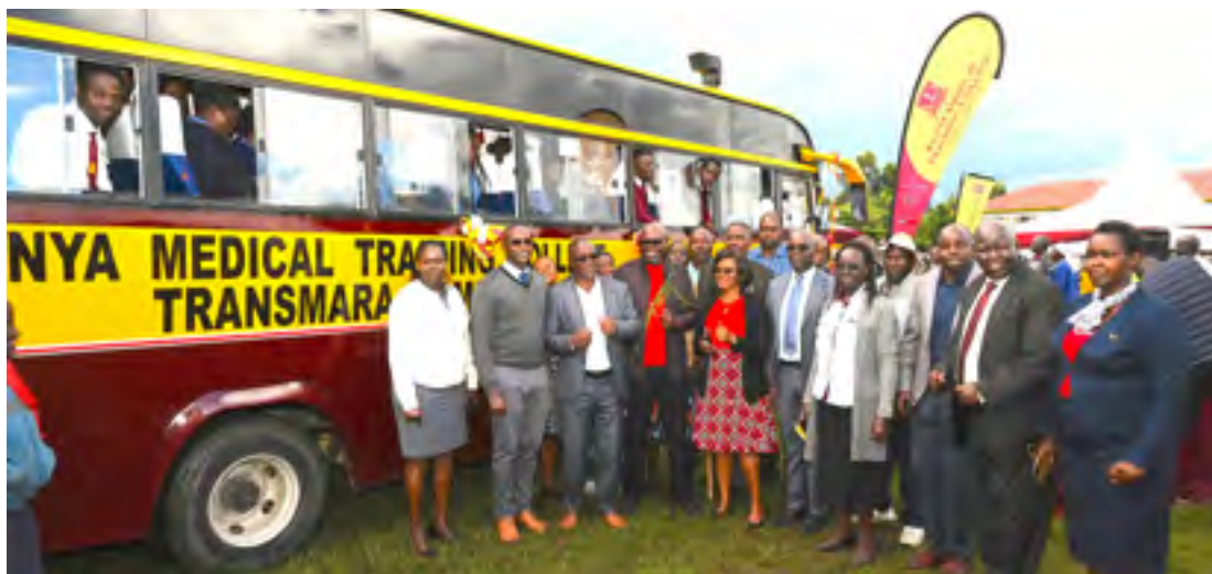
Dignitaries, staff and students during the function.

T ransmara Campus has received its first campus bus, a significant addition that will support student transportation and training activities. The new 53-seater bus was welcomed by students, staff, and members of the local community during a ceremony at the campus.