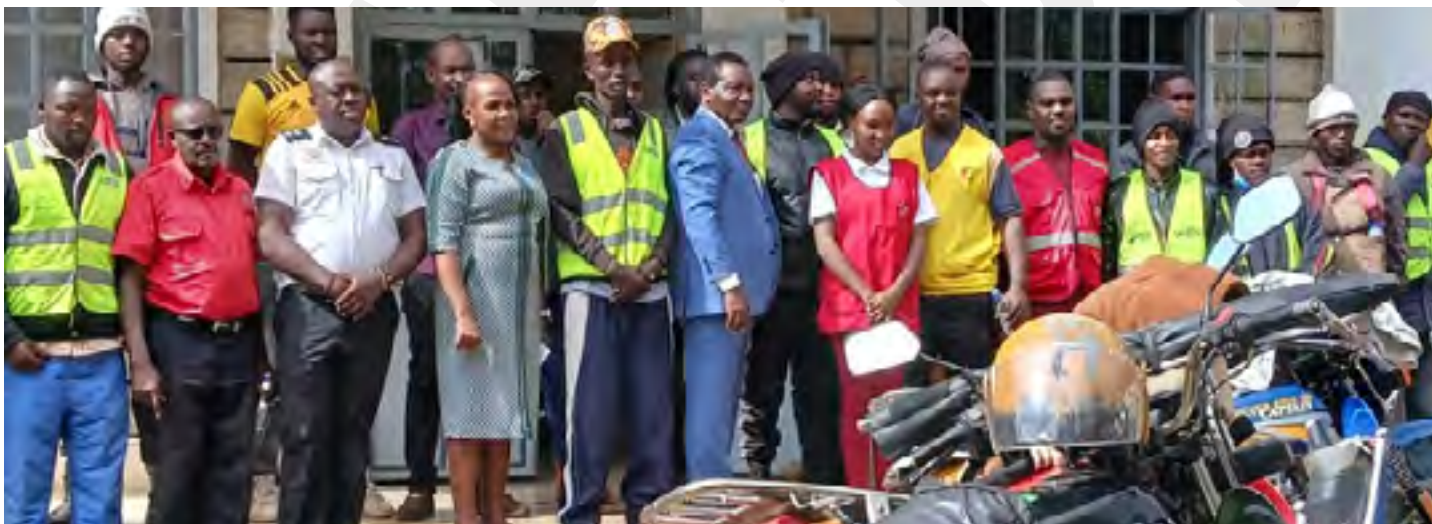
On May 14, 2025, Maua Campus partnered with Kenya Red Cross to conduct a boda boda training session, equipping riders with essential safety and first aid skills.