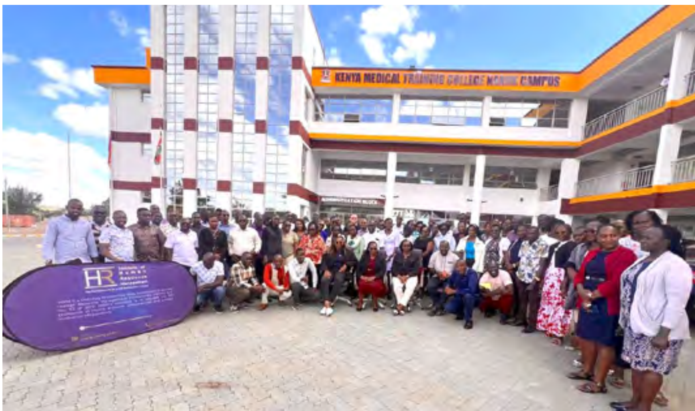
Participants during the training.

T he College has conducted a five-day capacity-building workshop for Human Resource and Administrative Officers to strengthen service delivery across its campuses.