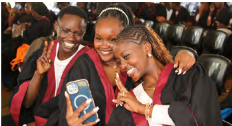
(File photo) KMTC Graduands during the 93 rd Graduation Ceremony.

He reminded the committee that graduation marks a major milestone, not only for students completing rigorous academic journeys, but also for parents and lecturers who invest emotionally, financially, and professionally in the process.